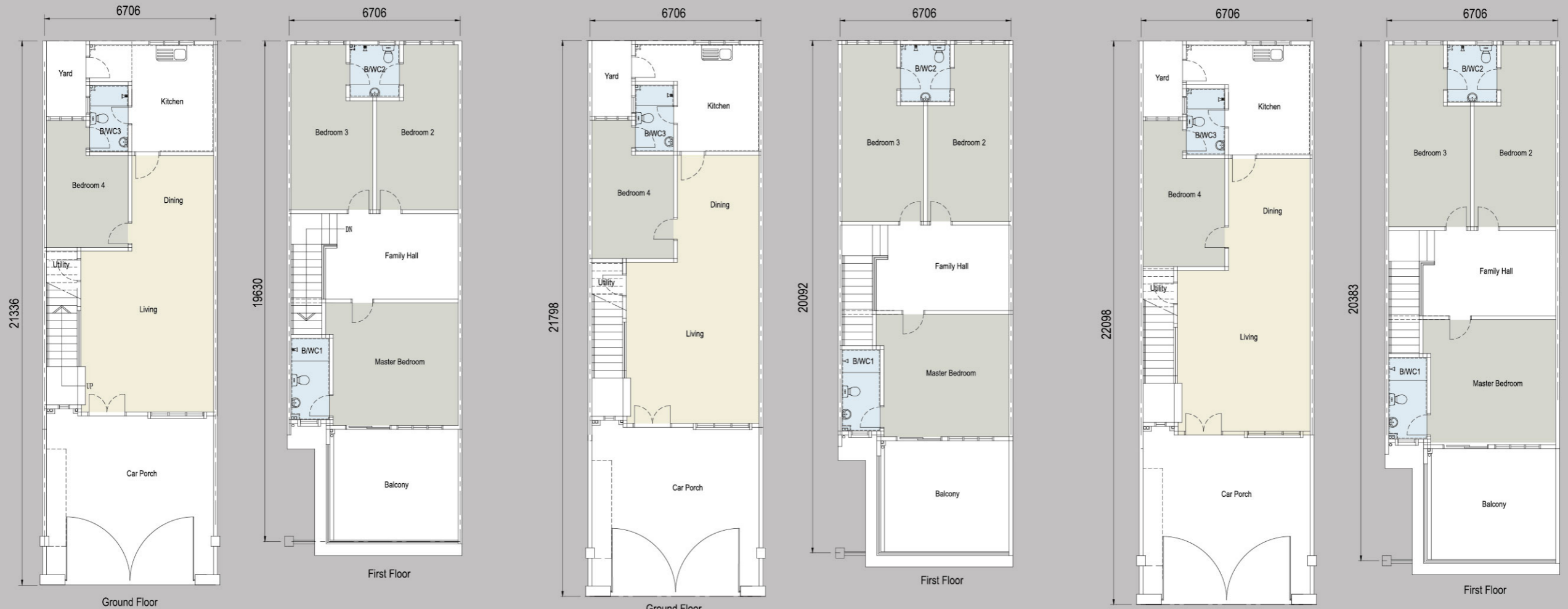
22' x 70' - Type A